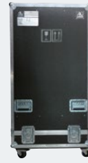
FALCON® FLIGHTCASE for FALCON® FLOWER and FALCON® BEAM (3,000 W)