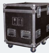
FALCON® FLIGHTCASE FLOWER I BEAM UNIVERSAL KIT (3,000 W)