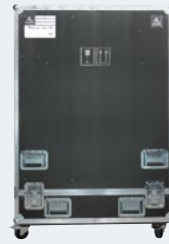
FALCON® FLIGHTCASE for FALCON® BEAM (7,000 W)