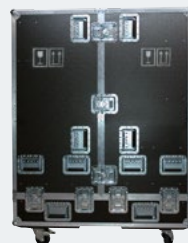
Left / right side