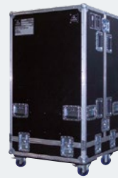
FALCON® FLIGHTCASE for FALCON® 4000 white